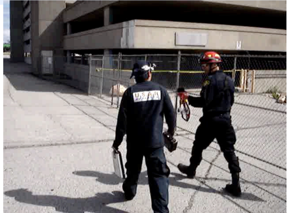
The “Oh Crap!” moment